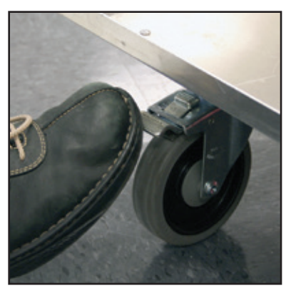
Caster Foot Brake