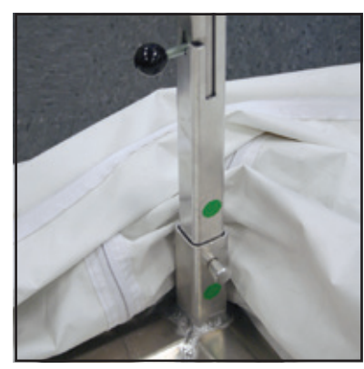
Corner Sleeve & Locking Pin