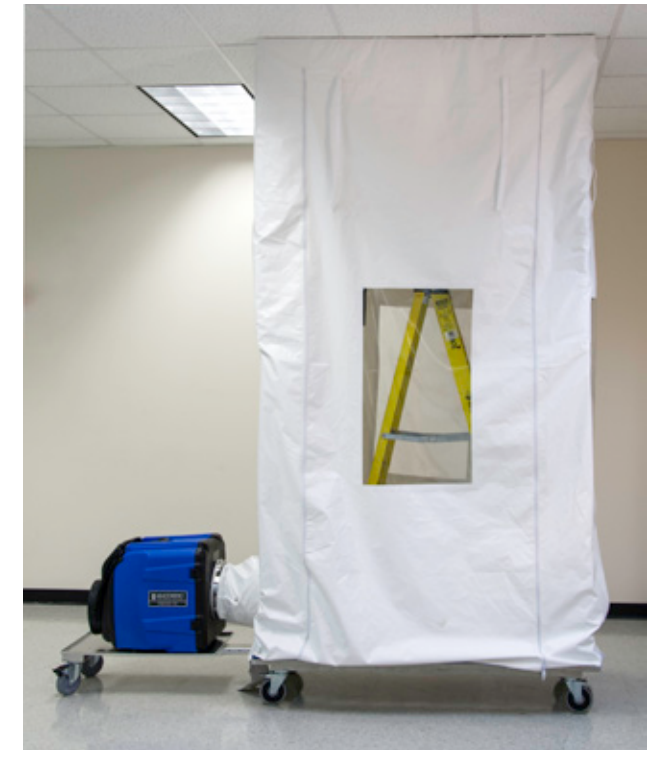
PRED750 Portable Air Scrubber & AG-CADDY cart are sold separately.

AIRE GUARDIAN MCCK is easy to roll to the job site, fully assembled. It can be safely used while still mounted on the 900-pound capacity cart, with the caster foot brakes locked; or, the frame and enclosure can be removed from the cart and placed on the floor. The convenient and easy to use height-adjustment knob and the numbered slots etched into each pole ensure that each pole is set to the same height setting. The fully assembled AIRE GUARDIAN MCC is plenty large enough to accommodate a worker on a 6-foot or 8-foot ladder.